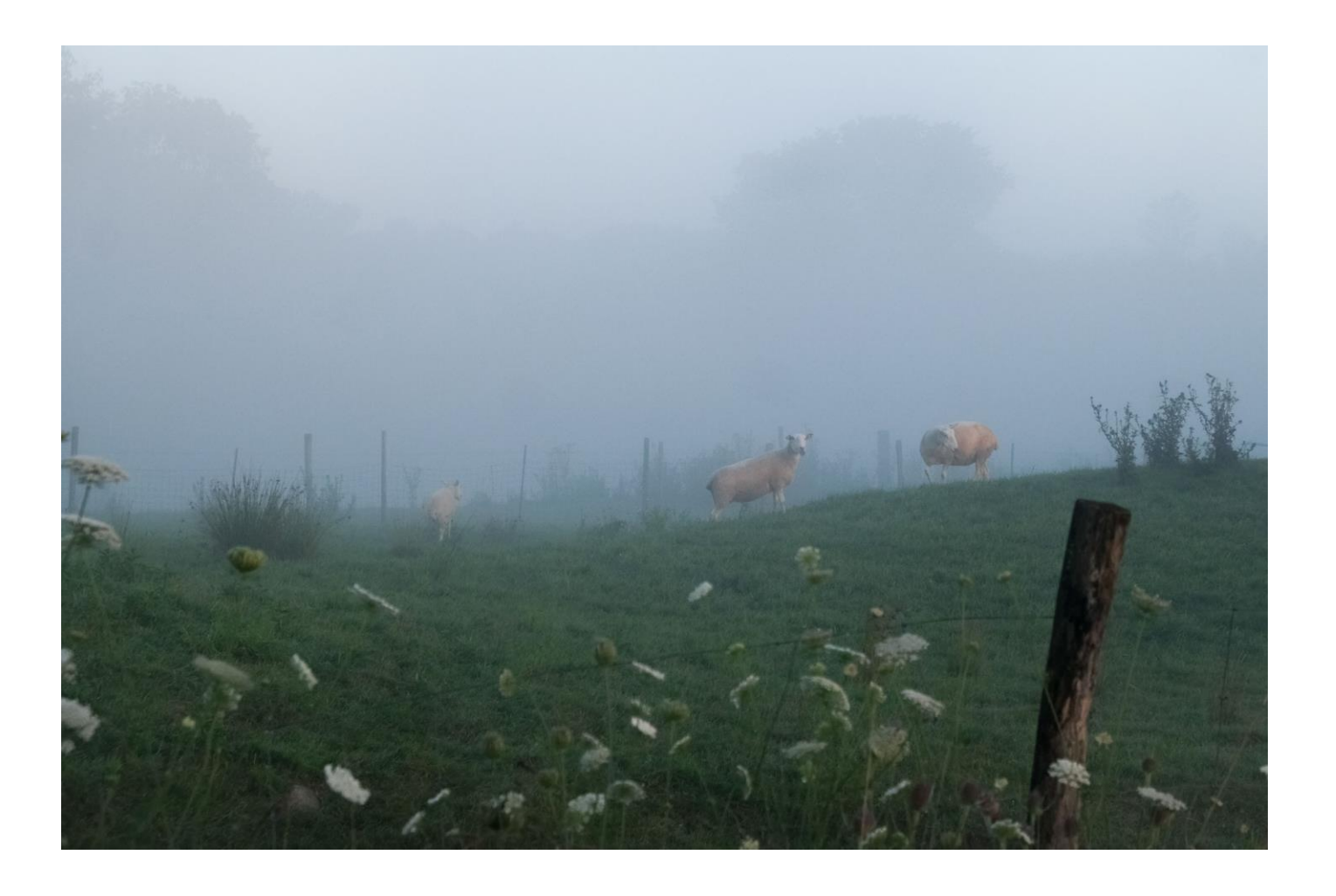
Signing up for lessons?! The best way is to contact me around Wednesday to see if there are openings for the weekend. Many people like to book weeks in advance to secure their "spot". If you think about it – herding season only really occurs over about 20 short weekends.