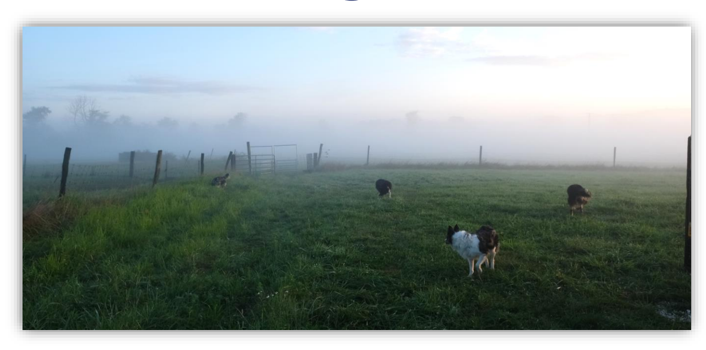
~ WHERE HERDING HAPPENS ~