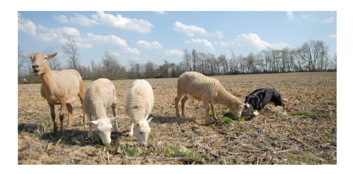
Photo Below - This dog is approaching in a smooth walk up. Putting pressure on the single sheep that needs to be moved first. Not using speed to move sheep.

Photo Above – the dog's speed has caused the sheep to go everywhere and thus sending the dog back out on another flank at the same speed in which it came in on them. This dog needs to be taught to slow down when approaching stock and to gently get them going and to keep them going at a much slower pace.