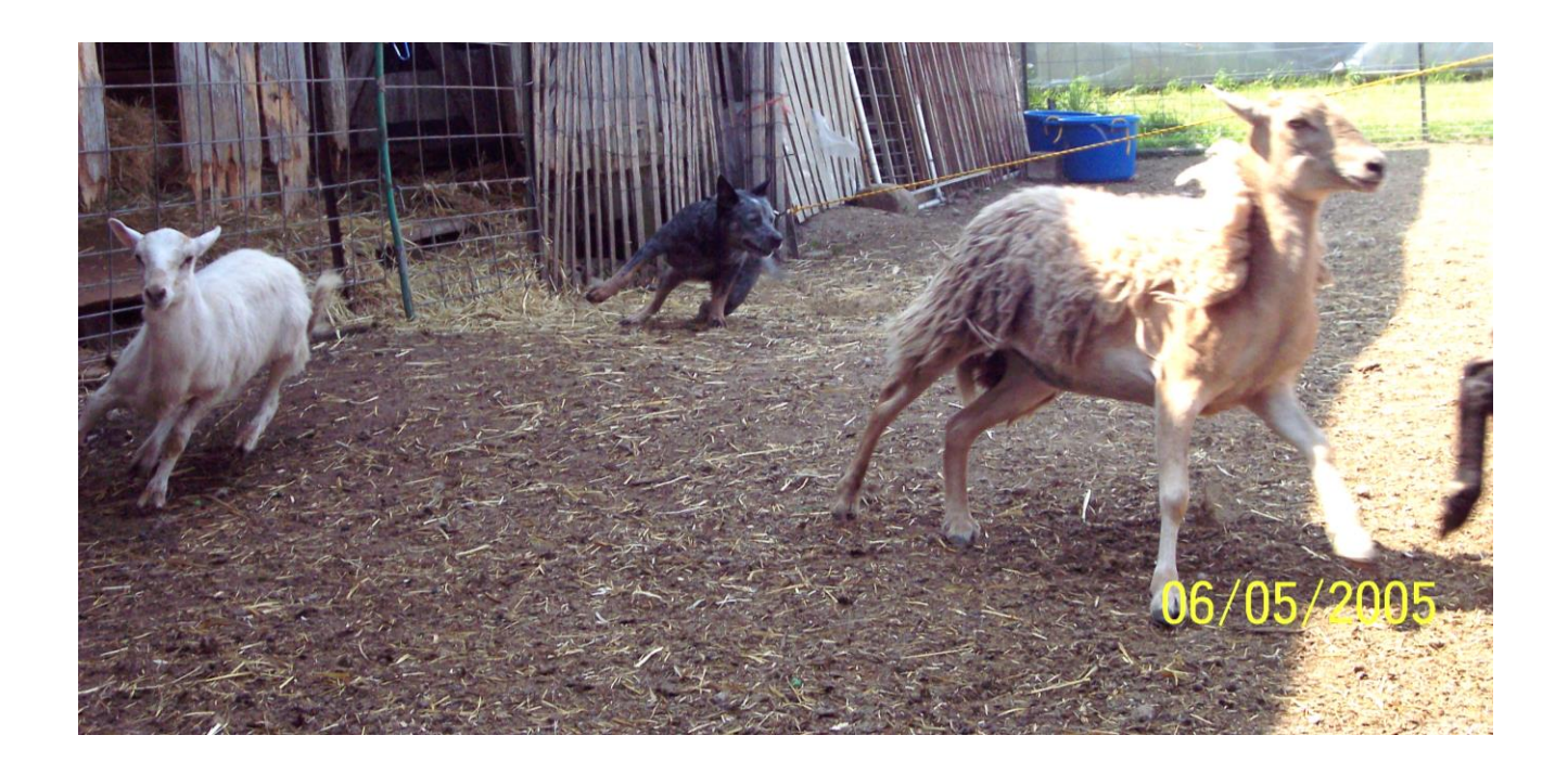
Photo Above – the dog's speed has caused the sheep to go everywhere and thus sending the dog back out on another flank at the same speed in which it came in on them. This dog needs to be taught to slow down when approaching stock and to gently get them going and to keep them going at a much slower pace.

Photo Below - This dog is approaching in a smooth walk up. Putting pressure on the single sheep that needs to be moved first. Not using speed to move sheep.