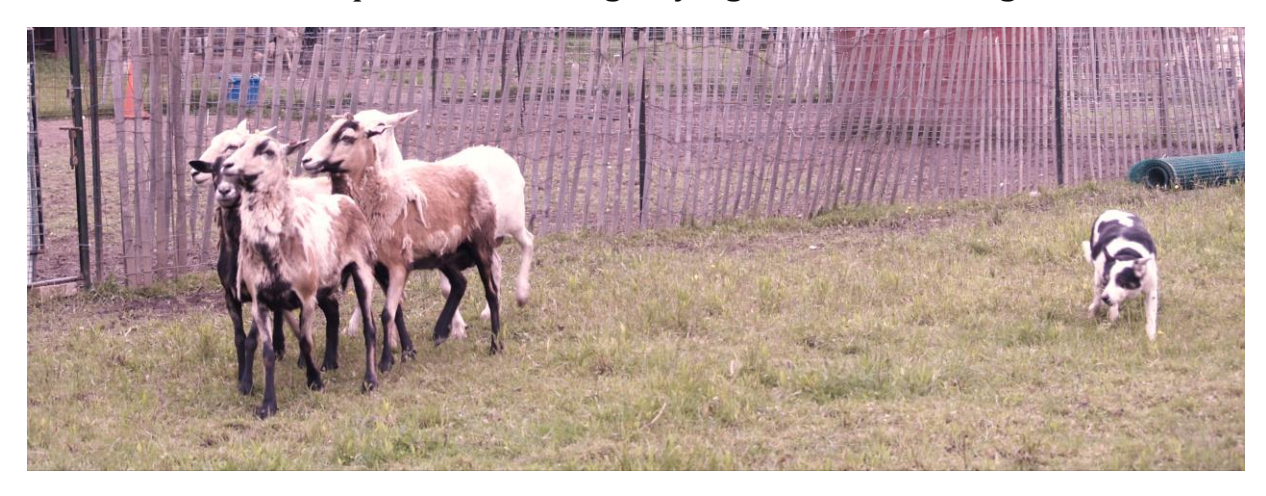
Photo Below – Dog not slowing down to give sheep a chance to WALK off, instead leaping off at a dead run