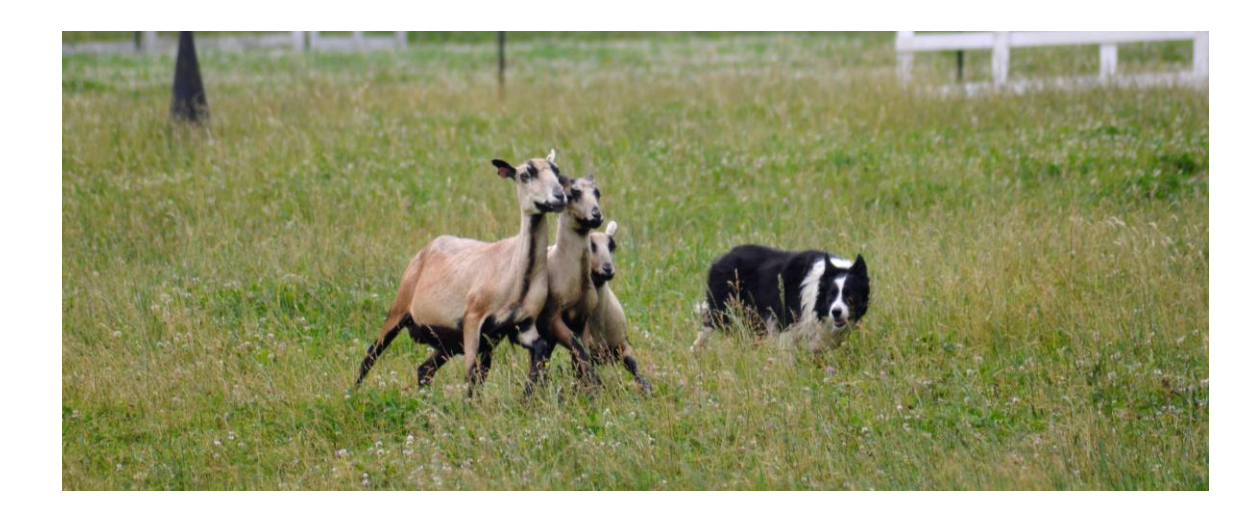
These two photos show dogs trying to hold the line given.